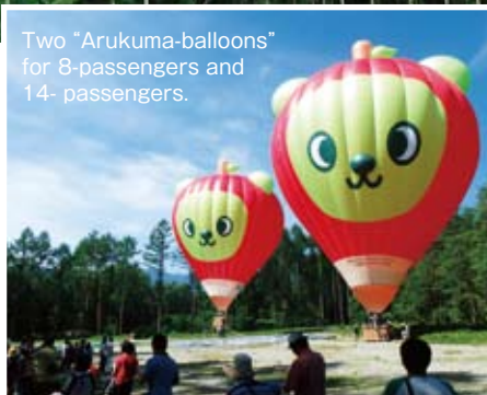
Two "Arukuma-balloons" for 8-passengers and 14-passengers.

Tethered hot air balloon flight, about 30m height.